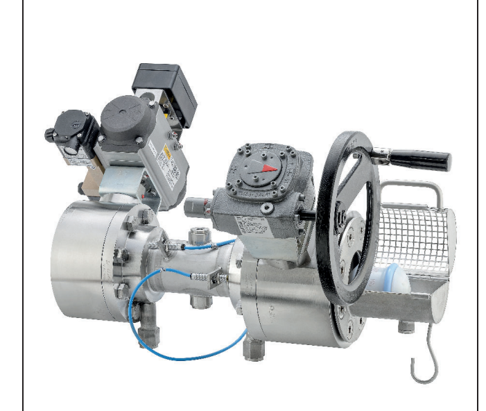
Fig. 1: Head station BR 28k

PFEIFFER Chemie-Armaturenbau GmbH · Hooghe Weg 41 · 47906 Kempen · Germany Phone: +49 2152 2005-0 · Fax: +49 2152 1580 E-Mail: sales-pfeiffer-de@samsongroup.com · Internet: www.pfeiffer-armaturen.com